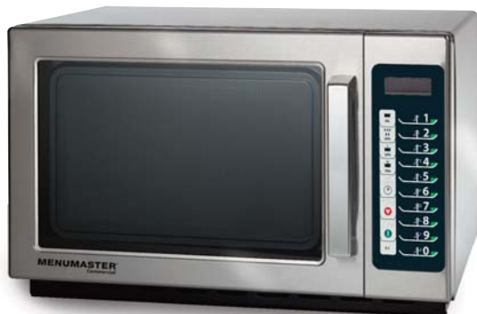
Model RCS511TS shown